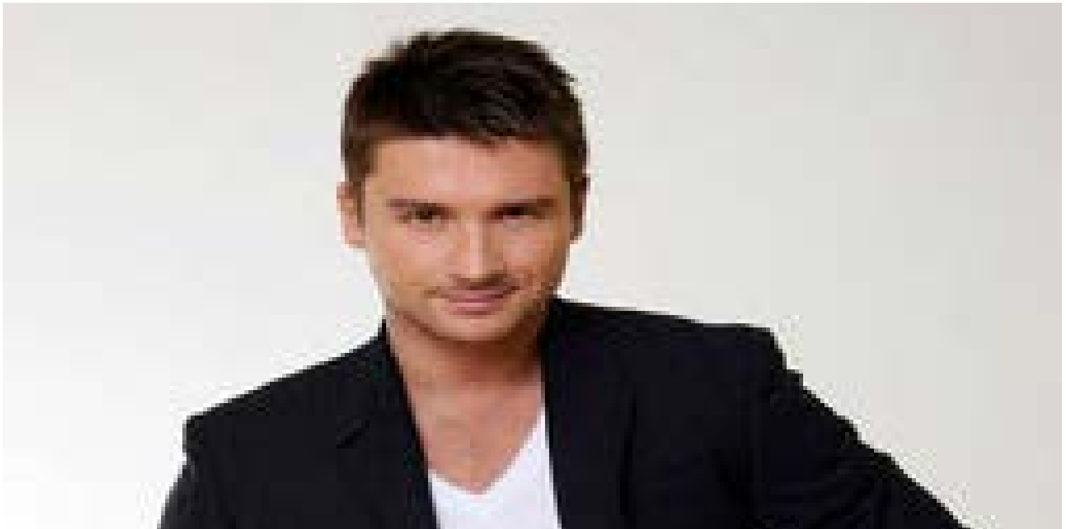
Sergey Lazarev - You are the only one (Eurovision 2016 Russia)